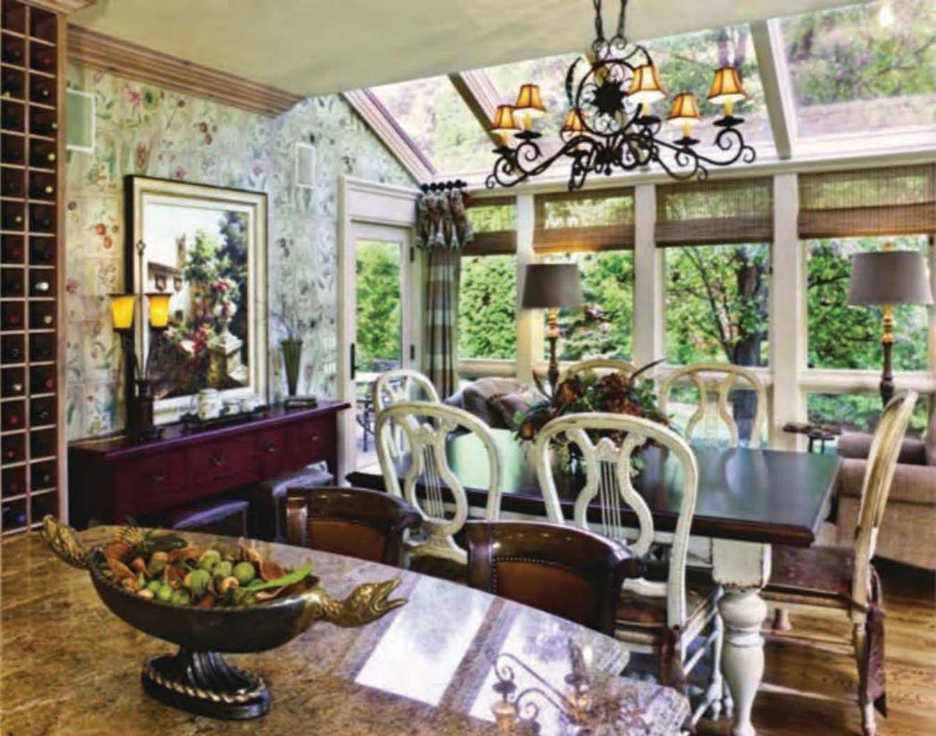
Above: Granite countertops tie a variety of elements together in the kitchen, which also features new furnishings. Below: An area rug with a floral motif grounds the newly designed living room, bringing a hint of color and texture to the mostly neutral space.