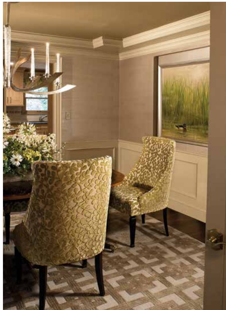
A newly carved niche was created in the dining room for an oil painting done by Greg White. Chairs wear a leaf pattern, while a shapely light fixture hangs overhead. The centerpiece is by Gerych's.