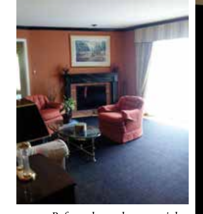
Before photo above; at right, everything in the music room is new except for the piano and the coffee table. A black crystal chandelier hangs above the piano. The painting was done by Greg White.